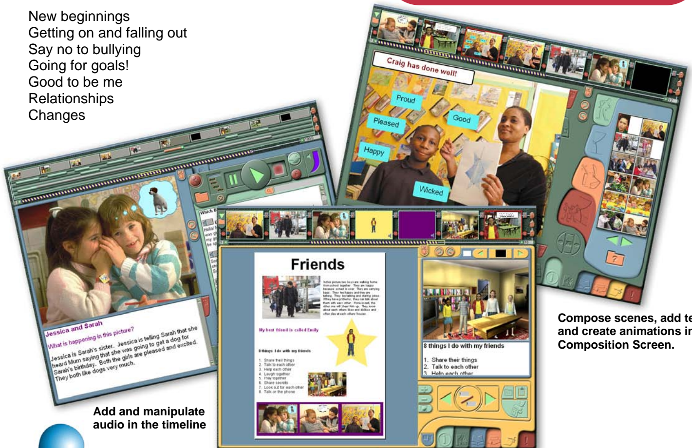
Add and manipulate audio in the timeline