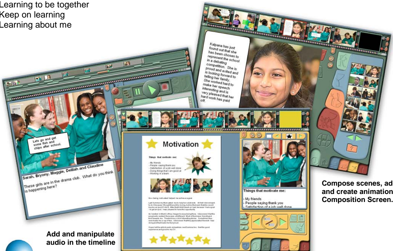
Add and manipulate audio in the timeline